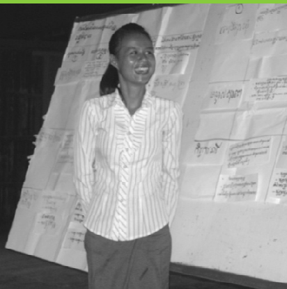
Siem Reap, Cambodia, 2010.

the risk of children contracting dengue and malaria, and to a lesser degree on how DRR relates to Human Rights.