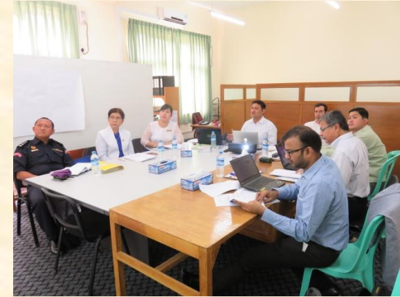
DRR & Early Warning Systems Sector