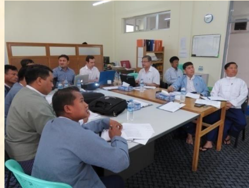
Energy, Transport & Industry Sector