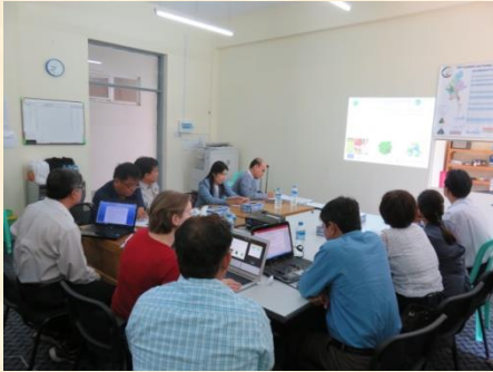
Urban, Building & Human Settlements