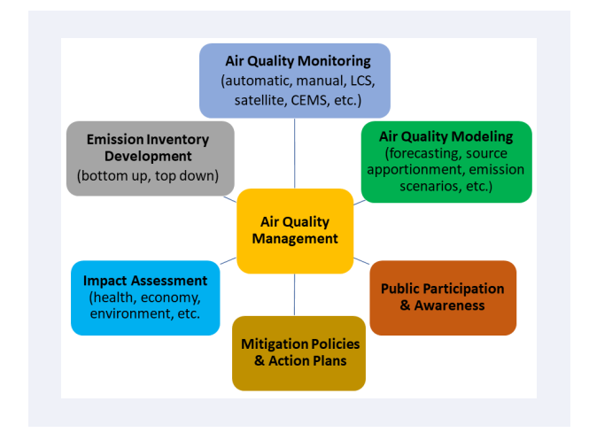
FIGURE 1. Components of air quality management.